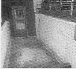
All types of poured concrete